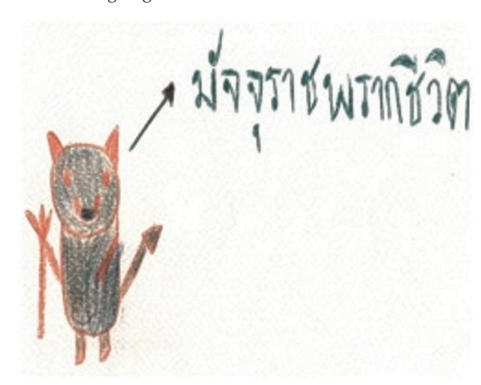
Figure 2: HIV as a killer

Songkean expressed a similar idea about HIV through her drawing (Figure 2).