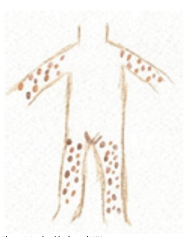
Figure 4: Noticeable signs of HIV

For many participants, their bodies had changed due to the side effects of antiretroviral drugs (ARV). These women thought that they did not look like a woman, but