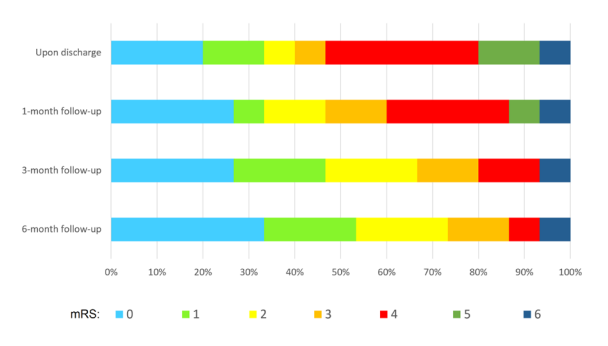
Fig. 2: Modified Rankin scale (mRS) of post thrombolysis patients up to 6-month follow-up

the American Stroke Association (ASA) recommendation of less than 25 minutes even at the first year of stroke code implementation. (20) Strong support from the Malaysian Stroke Council and nearby tertiary centres in terms of teleconsultation and intensive training had contributed to this positive outcome. (9) This was also partly due to the paperless hospital information system which enables speedy radio imaging interpretation as well as optimising telemedicine for rapid stroke code activation and consultation.(21) Furthermore, several physicians have previously been trained in a tertiary stroke centre. Moreover, this service was only available during office hours in our centre during the study period. Interestingly, the outcome of LACI strokes versus non-LACI strokes (PACI, TACI or POCI) is similar at 3-months and 6-months follow-up despite non-LACI strokes having a more severe presentation upon admission. This suggest that even a bigger stroke may eventually have a good outcome if patients are thrombolysed on time. Other possible factors for this outcome may also be due to the strict selection criteria of patients for rTPA and the small sample size in our study.