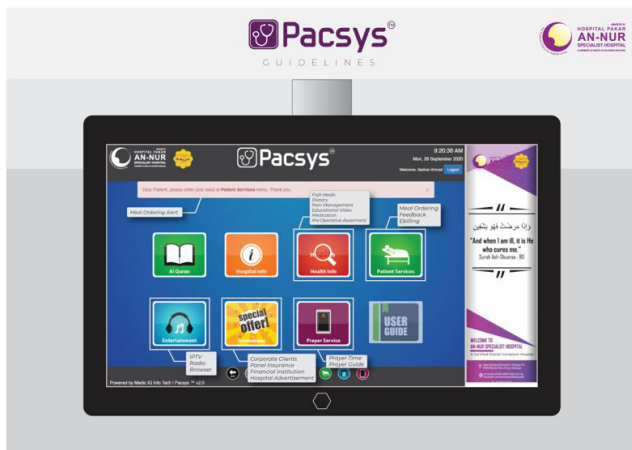
Figure 1: The Modules available on PACSYS

Table I shows that the majority of the respondents were between the age group of 20 to 55 years old, and they are potential users of PACSYS™ because of their essential Digital Literacy. Fifty per cent of the age group has intermediate knowledge of digital technology. This age group is a critical success factor for Empowerment through PACSYS™. With little guidance and their digital literacy knowledge, 90% of them explored the usage of PACSYS™. The high digital literacy indicates that there