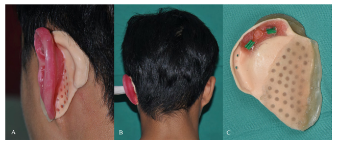
Figure 3: A: Ear wax pattern was attached to the custom baseplate chairside. B: Comparison to the contralateral ear during try-in. C: Clips position on the acrylic base.

luting composite (Quick Up®, VOCO America Inc, USA). Retention and fitting of prosthesis were verified by asking patient to perform facial movement including condylar movements, smiling, maximum mouth opening and talking. The position of the prosthesis was aligned with his contralateral ear (Fig. 4A and 4B). External staining process was carried out followed by sealant application.