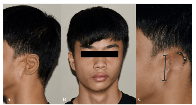
Figure 1: A: Profile photo with existing auricular prosthesis. B: Frontal view showing facial asymmetry. C: Skin marking of external auditory meatus location and the angulation of the long axis of ear with presence of implant bar attachment at the posterosuperior region.

An impression on the defect area was made using the tray-less impression, whereby a skin-marking pencil was used to place orientation marks which included the location of the external auditory meatus and the angulation of the long axis of the ear (Fig. 1C). The impression was made using irreversible hydrocolloid impression material (Kromopan , Lascode, USA), which was then mixed with an additional 50% of water to improve its fluidity to facilitate the impression procedure. A layer of quick-setting dental plaster backing was placed to provide rigid support for the impression. Orientation marks were imprinted on the impression's surface; this was then casted immediately to produce the working model. Then, the impression of the contralateral pinna