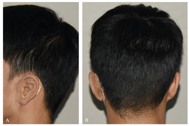
Figure 4: Post-treatment profile photos. A: Lateral view. B: Posteroanterior view

He was advised to clean the prosthesis with moist and clean cloth daily and avoid wearing the prosthesis during contact sport activities. Patient had also been asked to clean the peri-abutment skin with single tufted toothbrush or cotton bud with 0.12% chlorhexidine on a daily basis. The patient was very pleased and satisfied with the outcome of the treatment which gave him more confidence when wearing the prosthesis.