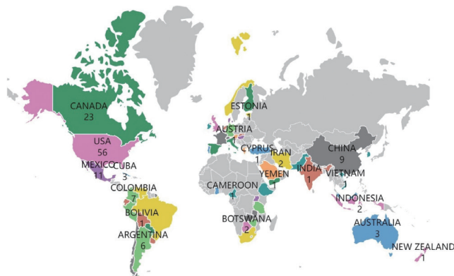
Figure 2 : The Publication Countries

The number of research papers published in different countries (see Fig. 2). The United States of America leads the way with a high output of 56 publications. It is followed by Canada with 23, Mexico with 11, China with 9, Australia with 3 and New Zealand with 1. Overall, this map reflects the differential distribution of research productivity across the globe, highlighting the strength of certain major economies in terms of scholarly publication.