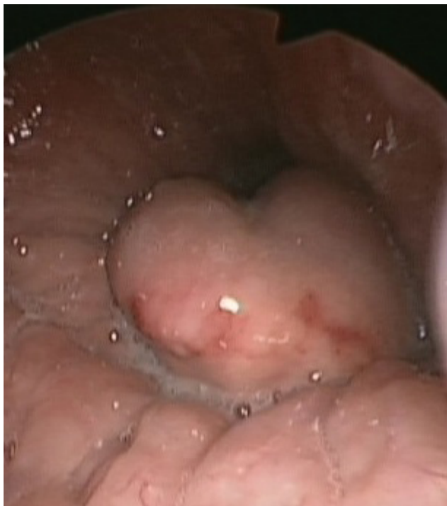
Figure 2: Fibreoptic laryngoscopy revealed a congested epiglottis narrowing the laryngeal inlet.